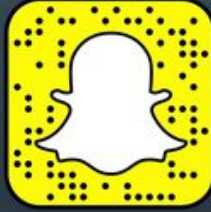
College Of Southern Idaho csieagles